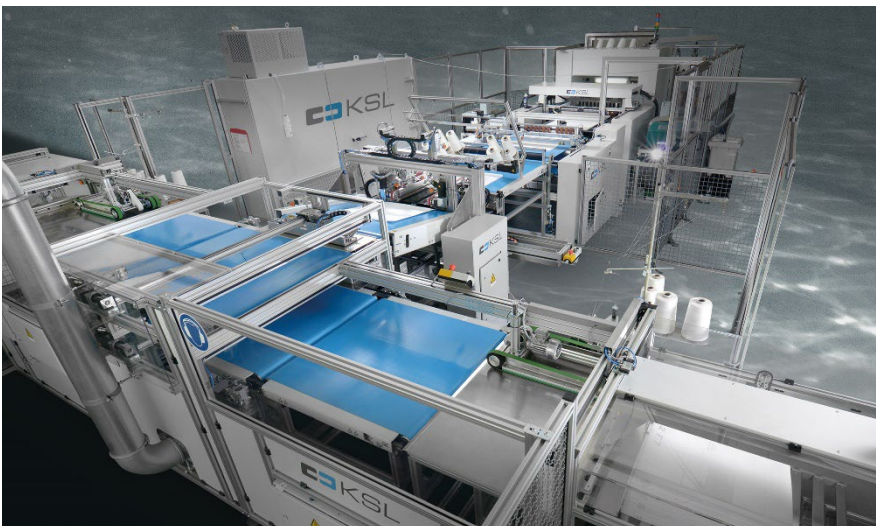
Example of a fully automatic filter bag production line from KSL (not shown at the fair due to size)

With the optimum processing method and the right machine concept (semi- or fully-automated), the companies can design and offer efficient, reliable and sustainable production solutions. With KSL in the Group, unique know-how in the field of automation and robot-supported production are available to the customers.